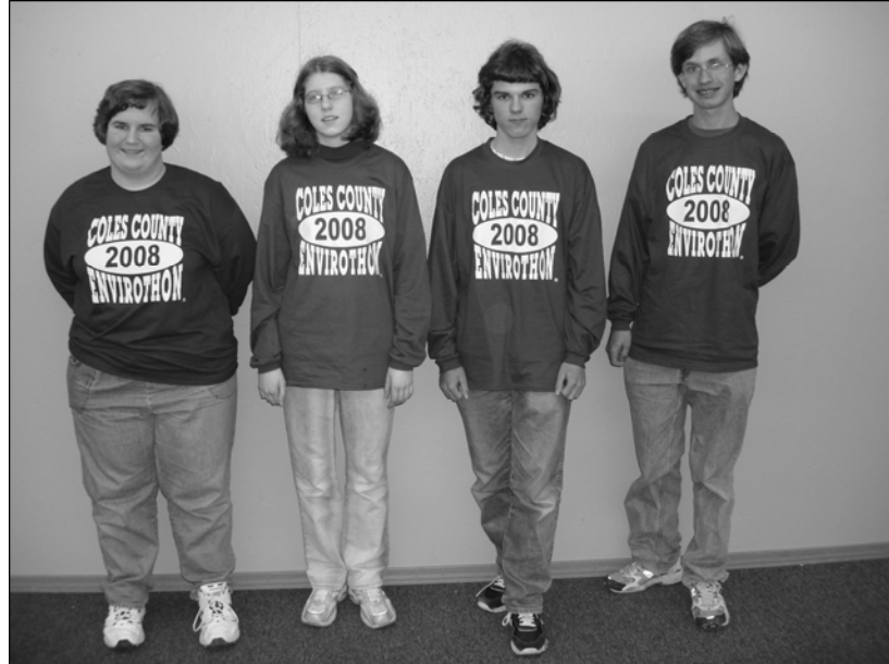
Members of the first-place Charleston High School Envirothon team.