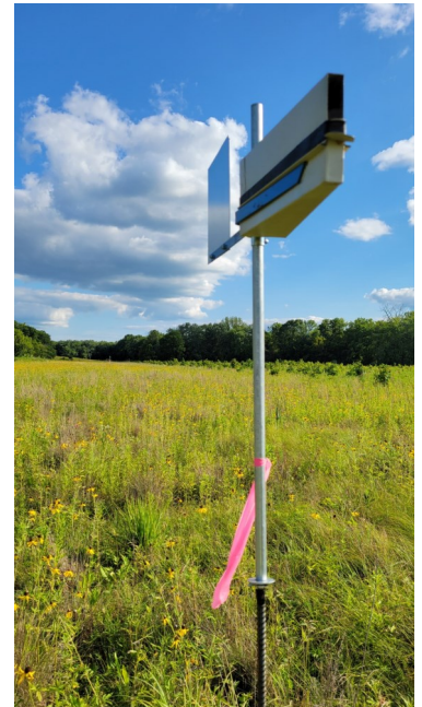
An airborne eDNA trap This device collects DNA particles in the air from the surrounding environment

Environmental DNA is another tool the project team is evaluating as a way to document pollinator richness. Remotely collected imagery and eDNA data are ground validated using traditional vegetation and pollinator field sampling methods. The research team will be hosting a field day in collaboration with Grand Prairie Friends. Learn more about this research and for a demonstration of technologies under evaluation. During the field day, we will discuss technologies that can assess habitat quality and inform management including: 1) drone imagery, 2) satellite imagery, 3) ground photography, 4) airborne eDNA, and 5) pollinator eDNA. The field demonstrations will include drone flights, two types of eDNA sampling, and traditional survey methods performed for both vegetation and pollinators.